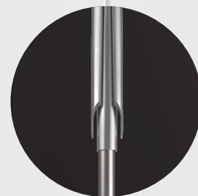
18G (Blunt) Accommodates 0.035" Wire